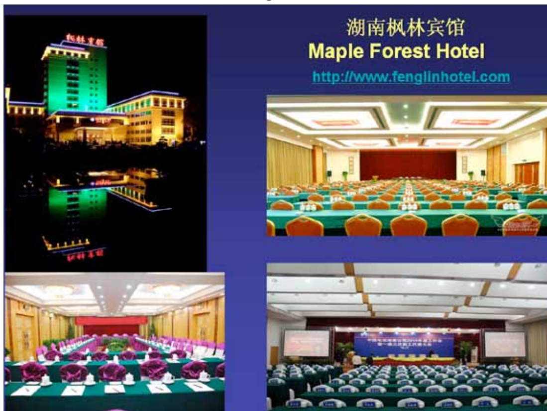
Maple Forest Hotel